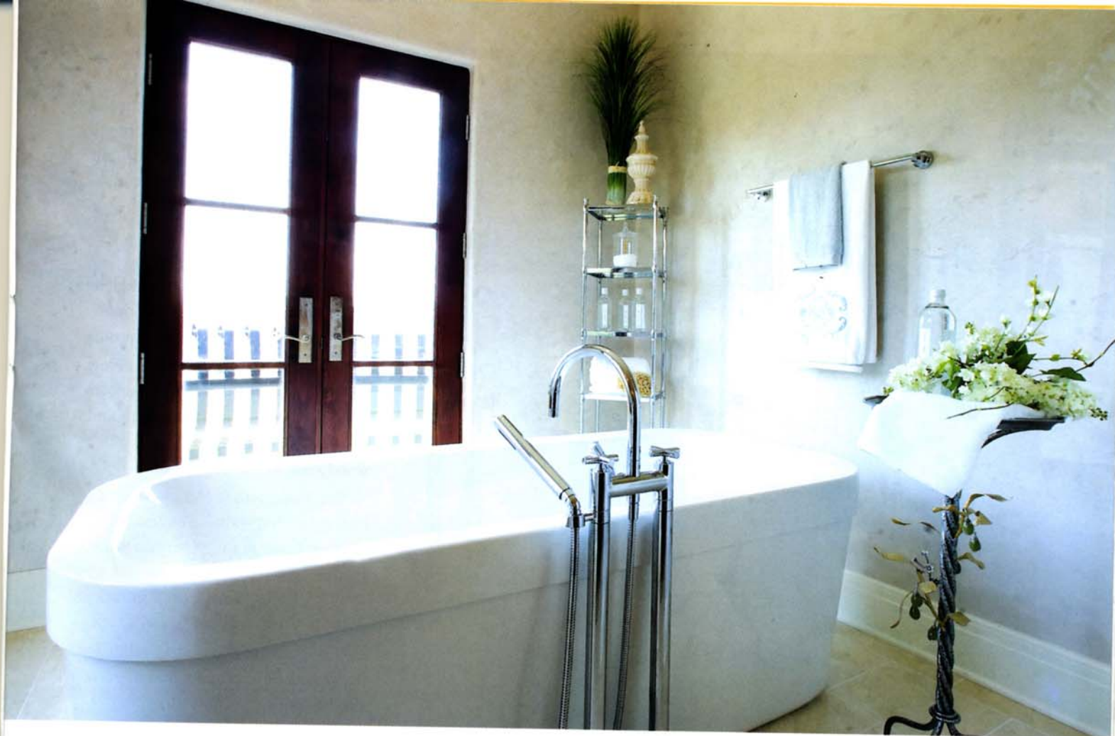
A luxurious free-standing tub in the master bath offers a serene spot to relax.

hours between 4 and 6 p.m., a quiet time at the end of the day, when the light shifts and brings out the colors of the buildings and roofs," says Gloe. "It's not a Disney-does-Tuscany kind of thing, but utilizes the Italian architecture to positively affect people's mood. People see homes like this when they're on vacation and remember them fondly."