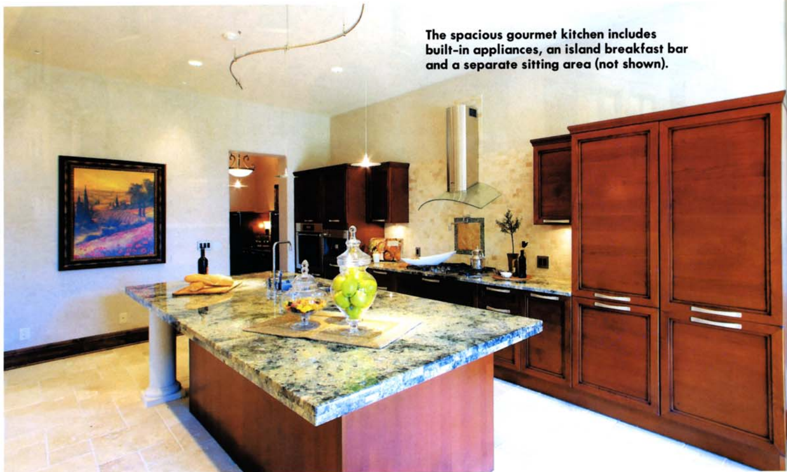
The spacious gourmet kitchen includes built-in appliances, an island breakfast bar and a separate sitting area (not shown).

Everything about Vespera was well-conceived, including the name. "We chose the name 'Vespera' because it's a Roman term for the