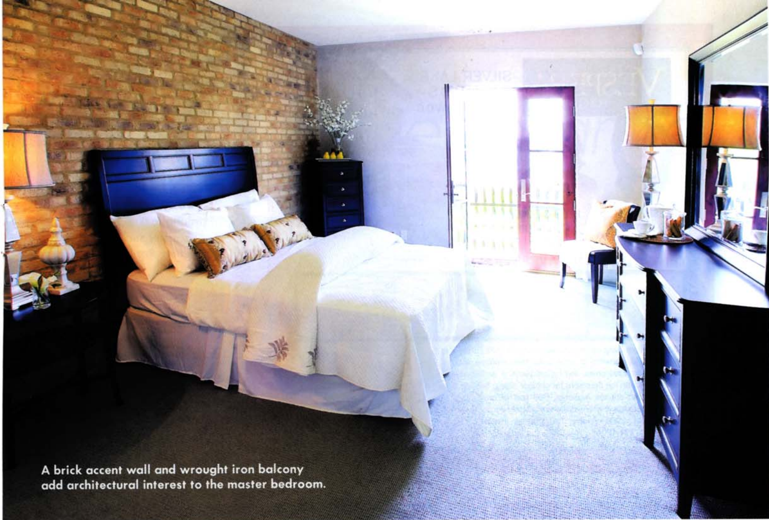
A brick accent wall and wrought iron balcony add architectural interest to the master bedroom.

Vespera residents will be able to enjoy 660 feet of beach on the crystal clear waters of Silver Lake with 12 boat slips available. "The condo association tends to the dock, slips and beach and all maintenance," says Shorewest listing real-estate agent Rebecca Sprague.