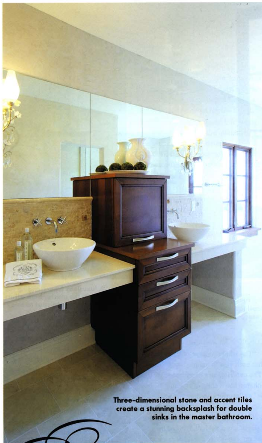
Three-dimensional stone and accent tiles create a stunning backsplash for double sinks in the master bathroom.

be different, unique, but also classic.” Flatt also likes the design of the kitchen. “There are so many special, useful details. The sleek, functional cabinets, the wonderful accent lighting, the butler’s pantry that transitions into the great room, it’s just a great kitchen,” she says.